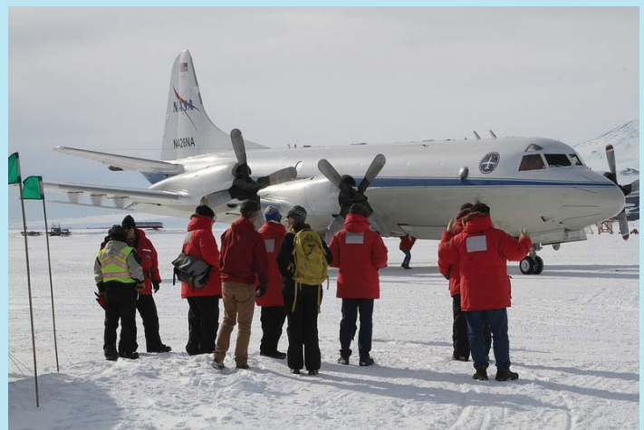
Image above: NASA P-3 lands Nov 16th. Photo by Jefferson Beck, from the Operation IceBridge blog. Visit http://blogs.nasa.gov/icebridge/ .

As with any mission to Antarctica, weather can play a factor and this time was no exception; the mission was shortened, and as of December 2, the crew was on their way back to the U.S. More information on the 2013 Antarctic mission can be found at http://www.nasa.gov/mission_pages/icebridge/news/fall13/ .